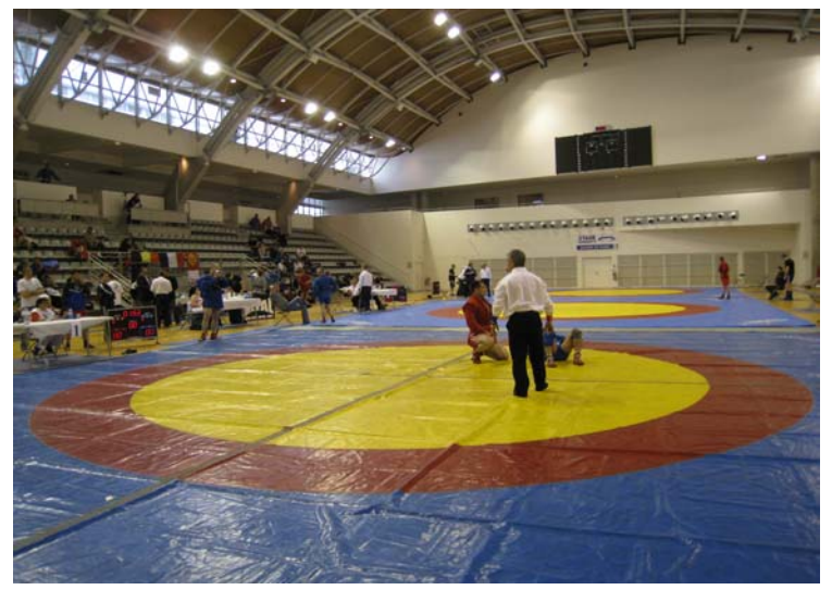
CHARLETY STADIUM- Charpy Room 17, avenue Pierre de Coubertin 75013 PARIS

To get to the Charléty Stadium, 17 avenue Pierre de Coubertin in 13<sup>th</sup> district, you can take the RER line B University Cité station or the buses number 21, 67, 88 and PC.